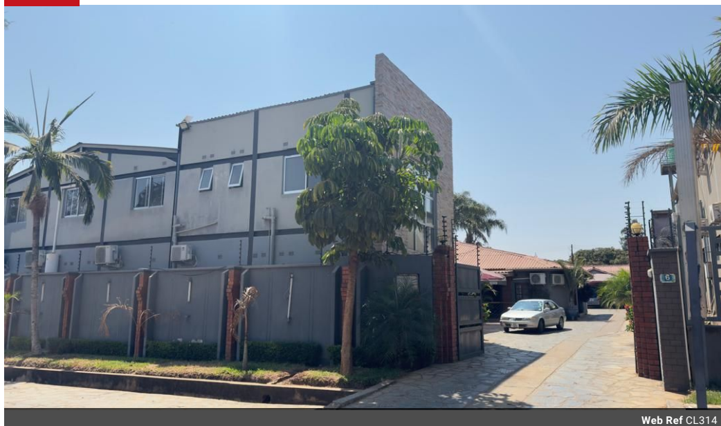
Web Ref CL314