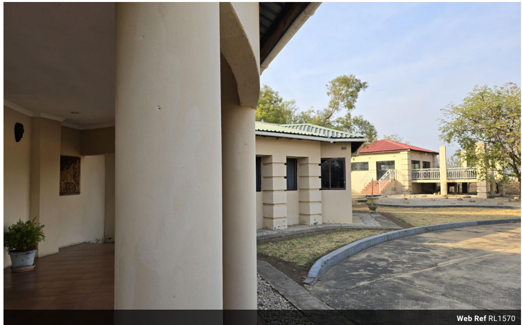
Web Ref RL1570

Foxdale Court 114 1st Floor, Second Building 609 Zambezi Road Roma Lusaka 10101