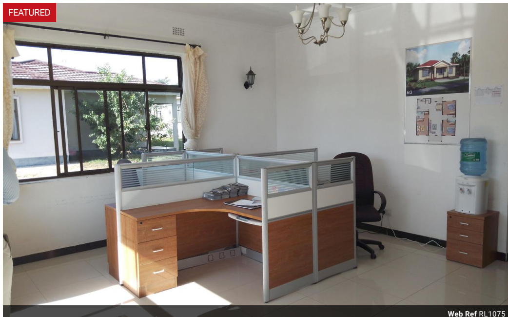
Web Ref RL1075

Foxdale Court 114 1st Floor, Second Building 609 Zambezi Road Roma Lusaka 10101