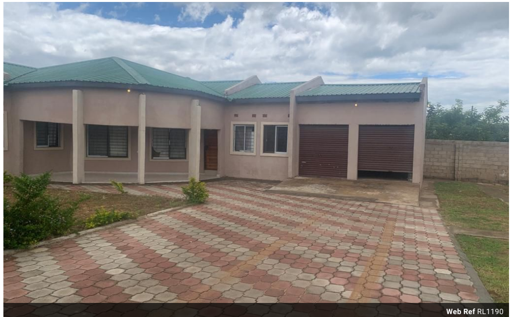
Web Ref RL1190

Foxdale Court 114 1st Floor, Second Building 609 Zambezi Road Roma Lusaka 10101