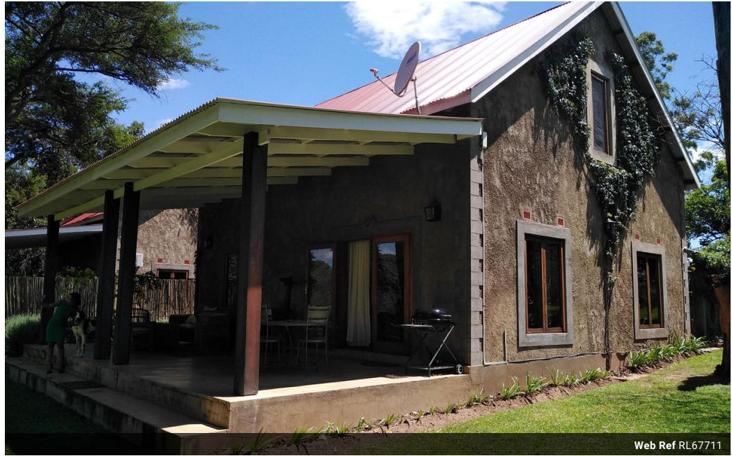
Web Ref RL67711

Foxdale Court 114 1st Floor, Second Building 609 Zambezi Road Roma Lusaka 10101