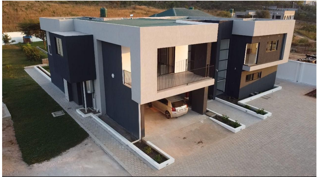
Web Ref RL1499

Foxdale Court 114 1st Floor, Second Building 609 Zambezi Road Roma Lusaka 10101