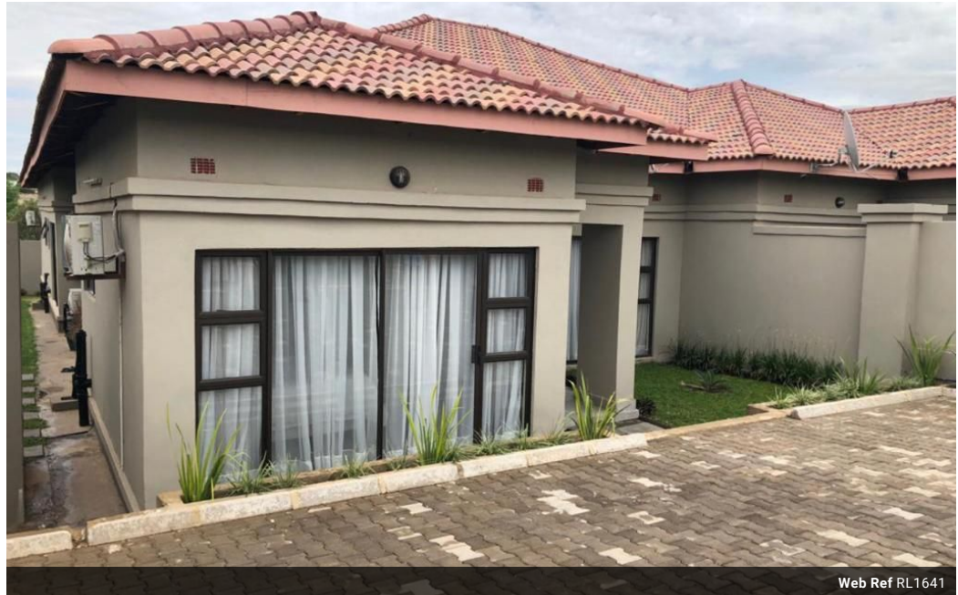
Web Ref RL1641

Foxdale Court 114 1st Floor, Second Building 609 Zambezi Road Roma Lusaka 10101